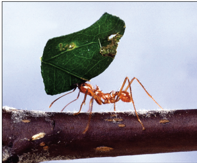
Figure 24.25 Leaf-cutter ant. A leaf-cutter ant transports a leaf that will feed a farmed fungus.