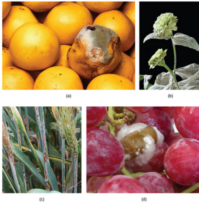
Figure 24.26 Fungal pathogens. Some fungal pathogens include (a) green mold on grapefruit, (b) powdery mildew on a zinnia, (c) stem rust on a sheaf of barley, and (d) grey rot on grapes. In wet conditions Botrytis cinerea , the fungus that causes grey rot, can destroy a grape crop. However, controlled infection of grapes by Botrytis results in noble rot, a condition that produces strong and much-prized dessert wines.

Aflatoxins are toxic, carcinogenic compounds released by fungi of the genus Aspergillus . Periodically, harvests of nuts and grains are tainted by aflatoxins, leading to massive recall of produce. This sometimes ruins producers and causes food shortages in developing countries.